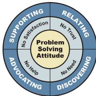
Counselor Approach Model

The Counselor Salesperson (CSP) is built around a 4-step consultative selling process that helps salespeople transition from simply making transactions to solving real business problems. Participants discover that having a different attitude, or a Counselor Mindset, is the first step toward building long-term, win-win customer relationships.